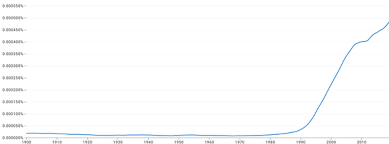
Fig. 1 Increased frequency in the use of the word stakeholder since 1990

In this context, it is worth examining the etymology of the word, and the power relations it has been used to indicate and reinforce. The word stakeholder derives from the word ‘stake’. The original meaning of ‘stake’ was a stick or post,