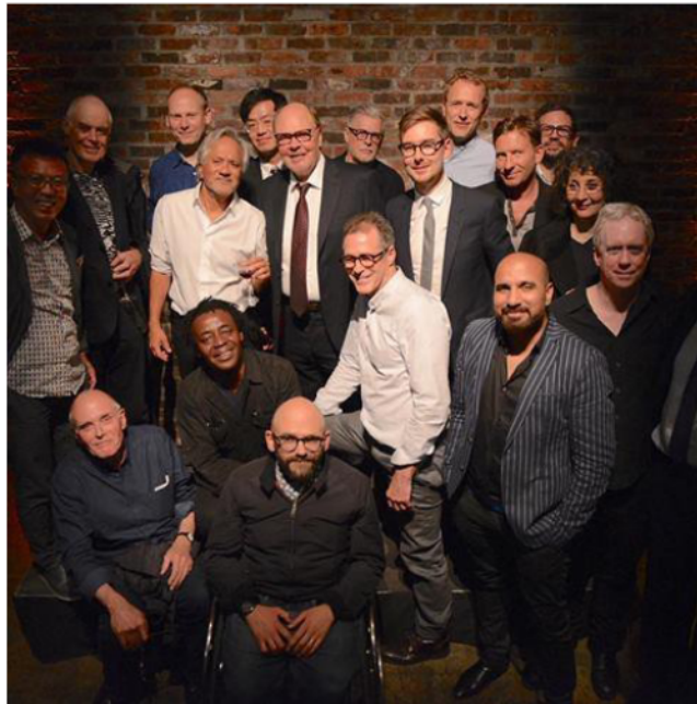
(Fig. 1) Lisson Gallery, Instagram post, 3 rd of May 2016 Celebrating the opening of Carmen Herrera at Lisson Gallery's inaugural New York Gallery opening

The exchange prompted a closer inspection of Lisson's gender ratio and the beginning of this research project. In April 2016, of the fifty-one artists Lisson represented via their London gallery: only ten were women. This led to the bigger question of whether Lisson Gallery was a particularly poor example of gender equality, or whether this was representative of the wider commercial sector and why. Perhaps most importantly, what is the wider impact of low representation of female artists in the commercial sector for career progression.