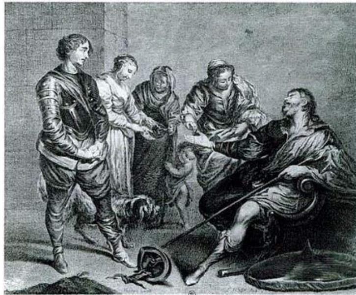
Abraham Bosse, after Luciano Borzone, Belisarius receiving alms , 1620-1630

military skill, duty). Age, time, hardship and mistreatment transform the military man into the military veteran who now demonstrates a differently performative masculinity through wisdom, stoicism and suffering. Whatever changes were wrought on this military man, they never completely negate his originating masculinity; the contrast only serves to add pathos and moral context to the narratives.