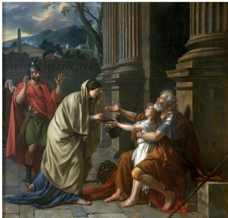
Jacques-Louis David, Bélisaire demandant l'aumône , 1781