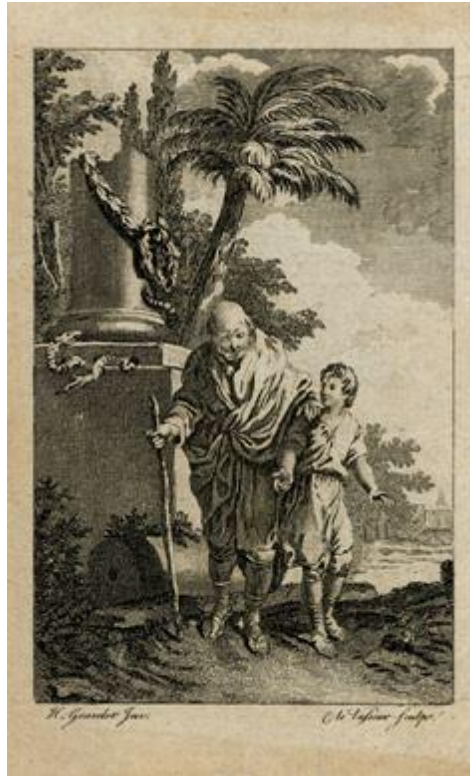
Gravelot, frontispiece to Marmontel's Bélisaire , 1767

should not have expected to see his history nor his representation any more privileged in death. In other words, he was ready-made as a victim, ripe for literary manipulation.