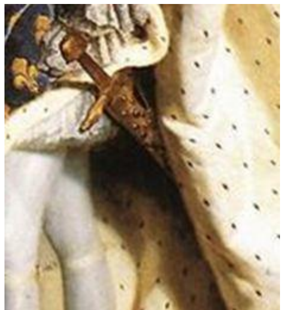
Hyacinthe Rigaud, Louis XIV , 1701, detail showing Joyeuse .

Despite the continuing ideological and cultural significance of the sword, by the eighteenth century the demise of the sword on the battlefield was nearly complete. According to the Encyclopédie entry for ‘armes’, the first mention of ‘pistolet’ on the battlefield comes from the end of the reign of Louis XIII (1601-1643). The entry continues : “les armes de l’infanterie, sont le fusil, la bayonette & l’épée. Cette dernière arme est entièrement inutile aujourd’hui.” 86 In his military manual Reveries on the Art of