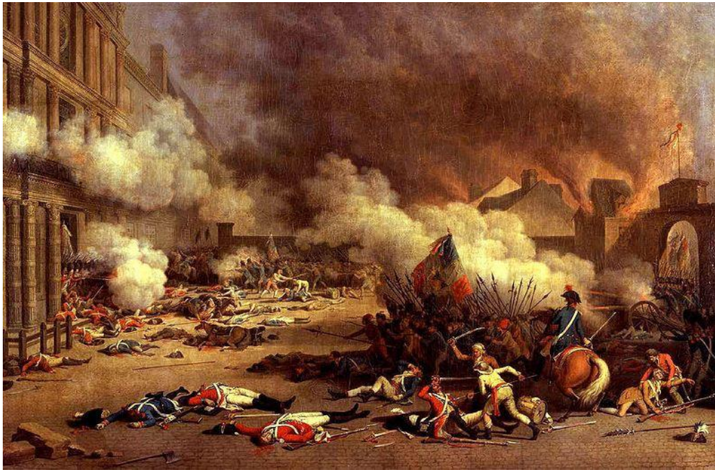
Jean-Duplessis-Bertaux, Prise du palais des Tuileries , 1793

siege. The king's elite French Guards had already mutinied on June 23 rd , 1789 when they took the side of the French people, unwilling to fire on their fellow citizens. The Tuileries was guarded only by troops of Swiss guards. The royal family managed to escape and take refuge in the Assemblée nationale . Drastically outnumbered, the Swiss Guards, depicted in their red coats in Jean Duplessis-Bertaux's 1793 painting, were massacred by the armed civilians. Historian John McCormack explains, "The Swiss Guard Regiment that had served France for nearly two hundred years [...] was exterminated." 241 News of these events caused "suffering and revulsion" throughout Switzerland and all remaining Swiss regiments in France were called home temporarily. Thirty years before this denouement Rousseau already understood that a nation of citizens, and especially a republic, had no place for the buying or selling of mercenaries, a topic discussed in La Nouvelle Héloïse , the subject of this chapter.