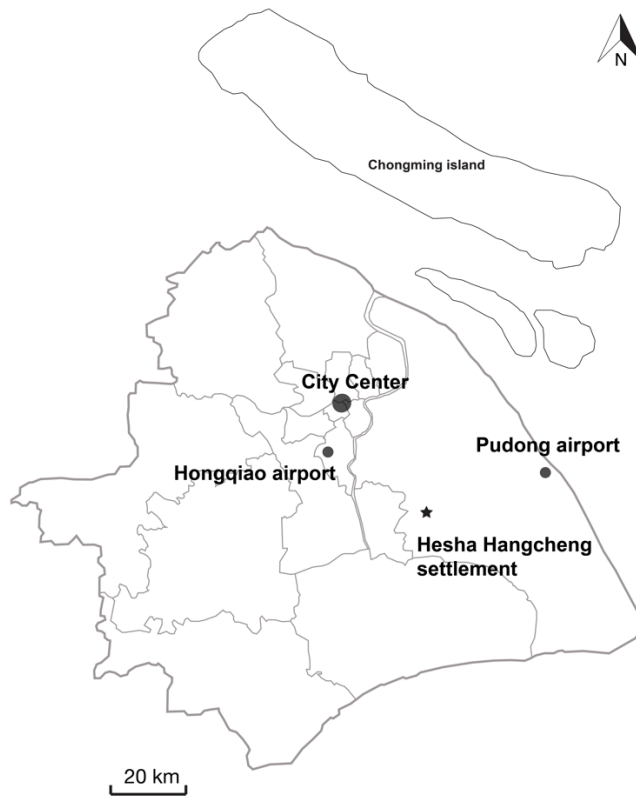
Figure 1 Location of Hesha Hangcheng relocation settlement

Despite the high level of compensation and relatively decent rental income of resettled residents however, support from residential committees and party branches in the newly developed residential neighbourhoods were still required for various reasons. During the early years, Hesha residents faced many challenges including the absence of basic infrastructures including roads, public transport, grocery shops, and schools (Senior official of Hesha government, July 2019). Another key challenge was to govern resettled residents, who moved in from almost all of the districts in Shanghai including inner city, peri-urban and rural districts. Residents were completely unfamiliar with their new surrounding and their new neighbours and needed help for many issues. For instance, although residential neighbourhoods were managed by private estate management companies, it often took several months before an estate management was hired to take over all the duties from the state owned developers. Residents therefore needed government support during this transition