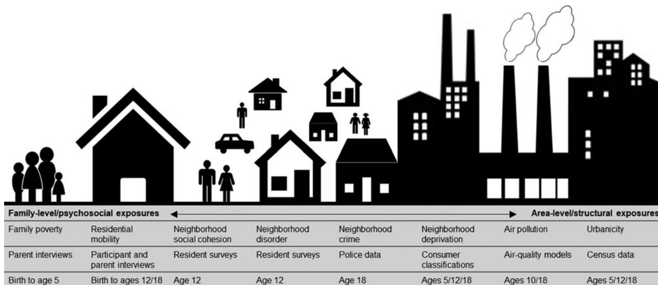
Fig. 1. Illustration of the nature and source of environmental risk variables used in this study.

mothers reported on their own mental health history and the mental health history of their biological mothers, fathers, sisters, brothers, and the twins' biological father (Weissman et al., 2000). This was converted into the proportion of family members with a history of psychiatric disorder (Milne et al., 2008).