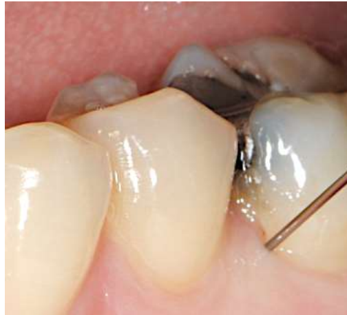
Figure 1 Intra-oral photograph showing the position of a conventional needle for ILA in a mandibular first molar tooth