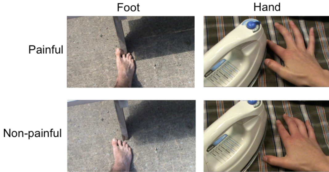
Figure 1. Examples of stimuli, depicting right and left hands and feet in painful and non-painful situations. Stimuli were based on those used by Gu et al (2012).