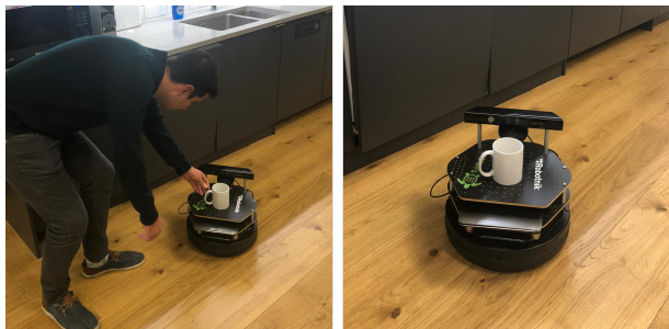
Figure 3: The Turtlebot 2 platform used in the second experiment to perform delivery tasks.