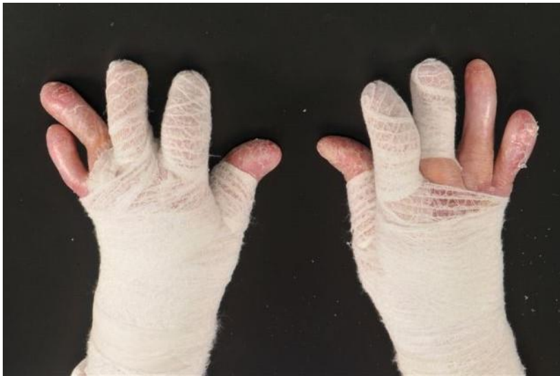
Image 2: Same adult's hands (from Image 1) with Metipel and Polymem dressings under bandages. This individual also wore black wool gloves over his dressed and bandaged hands to maintain his web spaces.