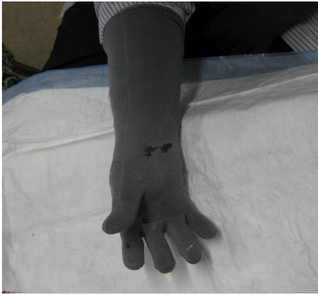
Image 3: Same adult from images 1 and 2 (right hand) in the dressing glove. The emollient applied began to strike through but was contained once the Skinnies web spacer glove was worn over the top (see below).