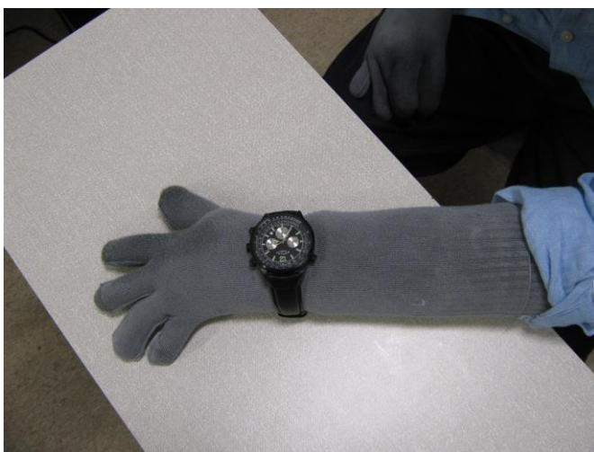
Image 4: Same adult's left hand wearing the dressing glove and the Skinnies web spacer glove (over the top of the dressing glove)