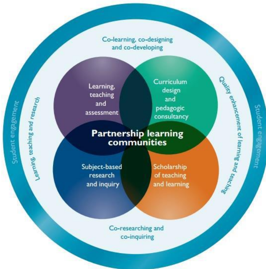
Figure 1: A conceptual model for students as partners in learning and teaching in higher education (taken from Healey et al., 2014)