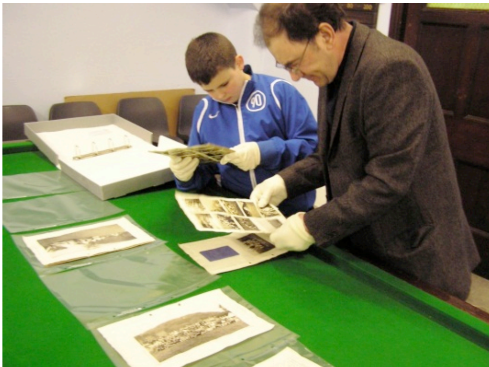
Figure 4. Club members helping to put photographs from past camps into an archive folder.