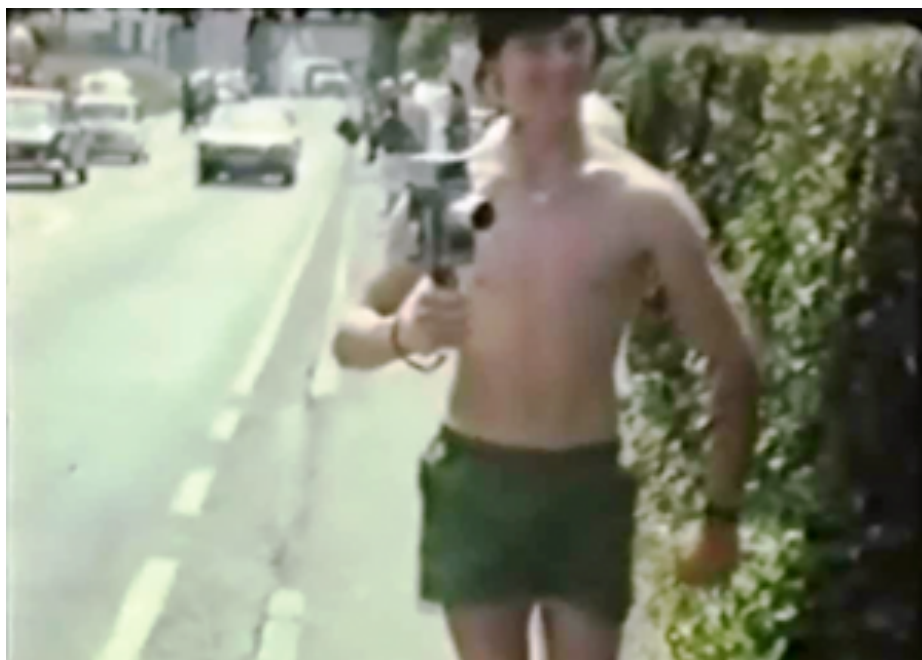
Figure 7. Filming the Salford lads arriving in Wales, 1977.

As with the photographic collection, the Club’s rare amateur films testify to the Club’s ability to mobilise technological means of representation well beyond what was affordable to individual households in the area (Fig. 7). Originally the function of these films was promotional, advertising the attractions of camp to the Club’s newest members, encouraging them to earn their place on next year’s camp, conditional as this was on their year-round attendance. With the passage of time a collection of films originally made to be useful (Acland and Wasson 2011), of merely topical interest, acquired value as scarce moving images of a cherished Club ritual.