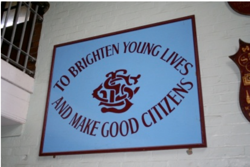
Figure 1. The Salford Lads Club motto on display above the main staircase.

Citizenship and notions of ‘the civic’ were core concerns of the lads club movement, explicitly raised in the SLC’s own motto “to brighten young lives and make good citizens”, a motto which hangs to this day on a large painted sign for all to see as they pass the threshold into the club’s main entrance hall (Fig. 1). Alongside the provision of gymnastics, football, boxing and a night school, an important part of the wider ethos of moral philanthropy, intervention and ‘improvement’ that such clubs aspired to was the annual camping trip. The first SLC camp took place in Llandulas, Wales, during the Whitsun week of 1904, starting a tradition that has been passed down through many generations of volunteers and young people. In 2011, the arrival of the one hundredth annual camping trip was taken as an opportunity to celebrate this tradition and reflect on its importance in sustaining the wider role that the club has played within its local community (see Dickens and MacDonald, 2014).