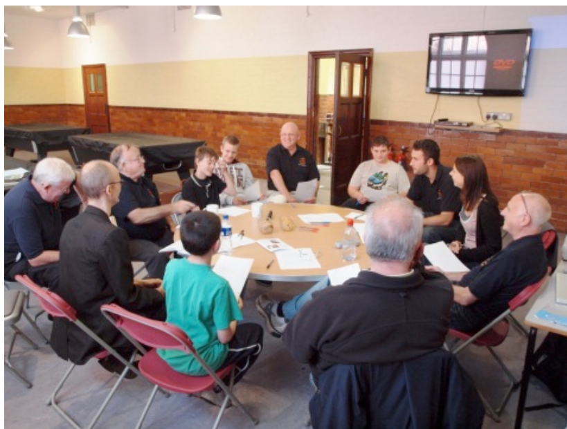
Figure 8. The Salford Lads telling tales from camp together in a story circle.

Shortly after the Club celebrated its one hundredth camp in 2011, the SLC began collaborating with the Storycircle team on the 'Tales from Camp' project, which resulted in a collection of fourteen short videos edited together from the Club’s own film footage and its photographic collection 5 . These were to be displayed on a looped DVD projection at the Edinburgh exhibition, alongside the ‘One Hundred Camps’ sequence.