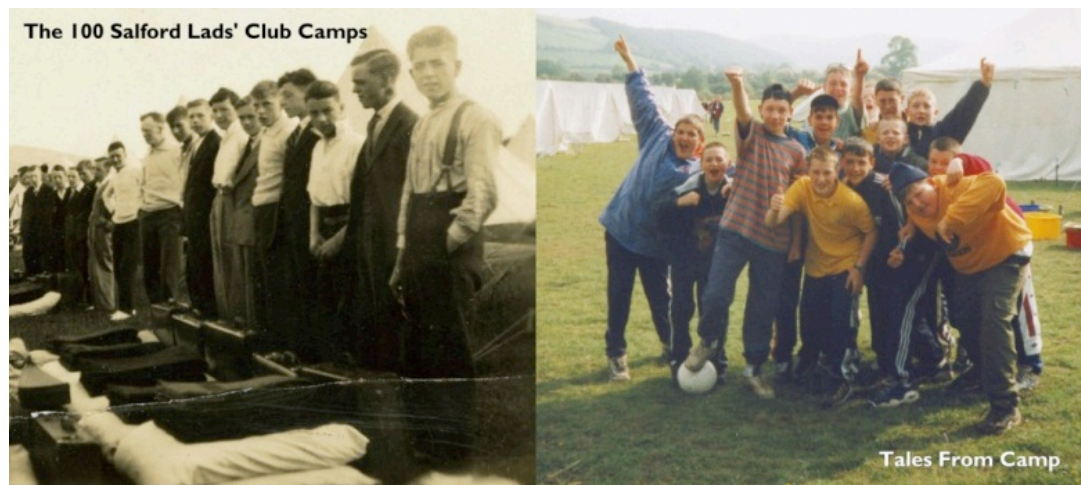
Figure 2. Flyer for the One Hundred Camps exhibition, which included the Tales from Camp films.

The centrepiece of the SLC's camping centenary celebrations was a permanent exhibition at the club called 'One Hundred Camps', which consisted of a collection of framed images relating to every year that the club went on camp (Fig.2). Alongside this, our research team supported club members of all ages – from 13 to 93 – through a digital storytelling process that focused on producing short films about their memories of attending the camp, called 'Tales from Camp'. As we discuss below, these exhibited materials, and the reflexive process through which they were produced, displayed and encountered, provides, among other things, an important chance to consider the potency of archives and collections that reside in civic organizations such as the SLC.