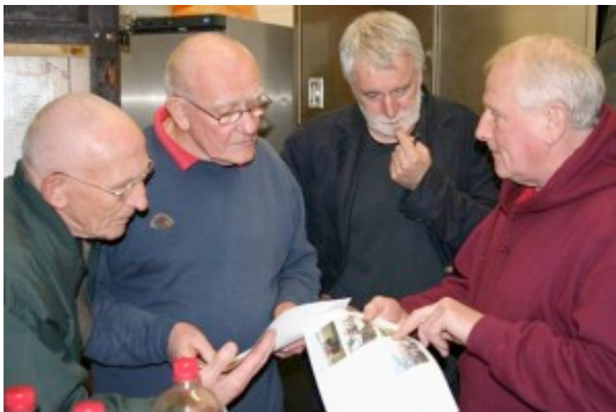
Figure 5. Officers try to identify the campers in the old photos.

gloves to sort through the original photographs and rehouse them in archival-quality photo albums (Fig. 4). Over successive club nights, older volunteers cross-checked the lads featured in the unidentified photographs with the membership records, the scrupulous camping registers and their own memories of where different camp sites were located or who had attended in which years, to establish a consensus on where to place them in the sequence (Fig. 5). Through this process, members engaged in the tangible retrieval of their shared history, musing on the similarities and differences with past generations of campers, their past lives and also re-considering their individual place within this collective tradition. Thus, this