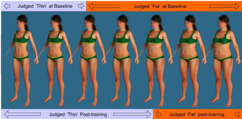
Figure 1. The middle row shows part of the body sequence varying in body mass index. The top row illustrates the results from a baseline assessment and the position of the categorical boundary prior to training. The bottom row illustrates the results from the post-training test session, showing that the categorical boundary has shifted relative to the pre-training result.

had previously judged as fat during baseline measurement, to be thin. By contrast, in the control condition, the feedback to participants was consistent with their categorical boundary as measured at baseline, and was intended merely to reinforce their existing categorical boundary.