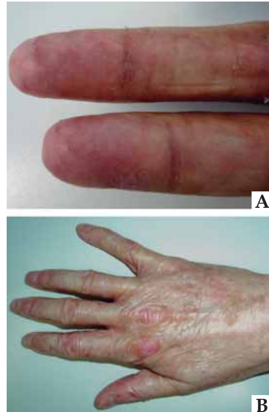
FIGURE 2: Patient number two with absence of dermatoglyphics (A) and skin atrophy with actinic keratoses (B)

that his fingerprints could no longer be obtained for identification purposes as a result of absent dermatoglyphics (Figure 2).