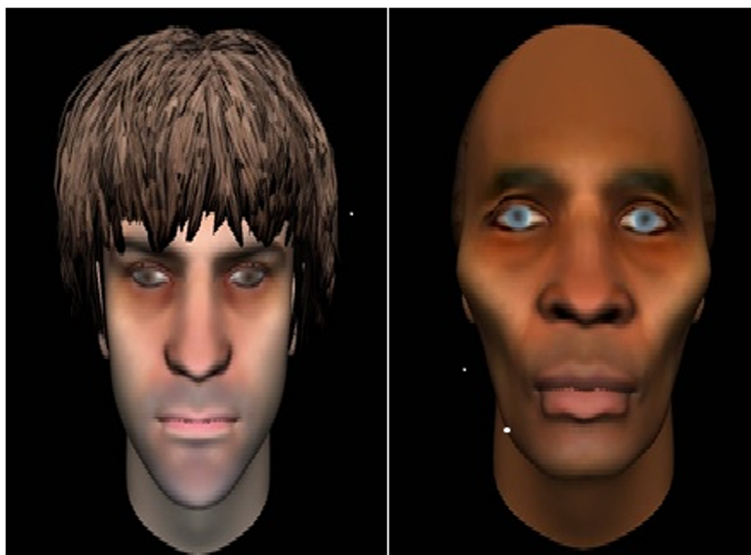
Fig. 2 Examples of avatars

developments within the context of a novel therapeutic milieu. The main goal of this therapy is to facilitate a dialogue between the patient and a computerised representation of their persecutory voice in which the voice hearer is assisted to gain control over the distressing voice. The approach uses computer technology developed by the Speech, Hearing and Phonetics Department at University College London which enables each participant to create a visual representation of the entity (human or non-human) that they believe is talking to them. Additional software is used to transform the voice of the therapist to match closely the pitch and tone of the voice the patient reports hearing, the two processes finally being combined to produce a computer simulation (a virtual agent or 'avatar') through which the therapist can interact with the participant. The therapist promotes a dialogue between the participant and the avatar in which the avatar progressively comes under the participant's control. The sessions are audio-recorded and provided to the participant on an MP3 player for continued use at home [19].