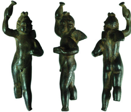
FIG. 2. Piercebridge, figurine of naked Cupid (No. 2). Scale 1:1.

bird, torch, and a pomegranate as well as vessels and weapons). 20 The findspots of examples reported to the PAS, including Piercebridge and others (e.g. CAM-E31F28; BERK-536215; BERK-EA42E1), support Durham's observation that their distribution is widespread across the province. 21