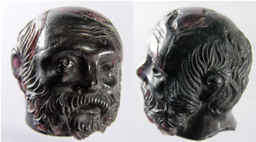
FIG. 20. Brampton, miniature garnet head of Socrates (No. 20). Scale 3:1.

The features described above appear already in the earliest depictions of Socrates (types A and B) in the fourth century B.C. The portrait represented here, however, is a composite of the two types, this being the commonest form of his depiction in the imperial period. 89 Portraits of philosophers were a popular subject in the Roman period on engraved gems (intaglios and cameos) made from precious and semi-precious stones. 90 However, other examples of a secure British provenance are not known. 91