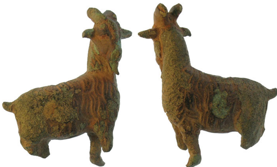
FIG. 3. Kirkby Fleetham, figurine of a standing goat (No. 3). Scale 1:1.

(4) Sessay (SWYOR-91A033) (FIG. 4). 26 An incomplete copper-alloy hinged baldric fitting of third-century A.D. date, 33.7 mm long, 22.3 mm wide and 4.9 mm thick. The openwork plate is pierced by triangular and semi-circular perforations which leave a network of spokes connecting the edges of the plate. At the unbroken end is a circular hole, perhaps for a rivet, which is filled with copper-alloy of a different patination to that of the plate, and a hinge with three loops which hold the corroded remains of the axis bar. Similar baldric fittings are known from Aldborough, N Yorks., Silchester, Hants., and Ashwell, Herts. (BH-D36487). 27 Belt fittings and buckles of the early to mid-imperial period are widely distributed across eastern and southern England. 28