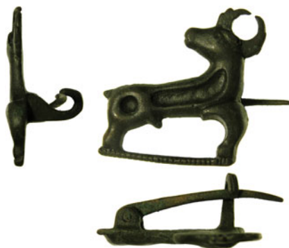
FIG. 15. Teversham, zoomorphic plate brooch in the form of a stag (No. 15). Scale 1:1.