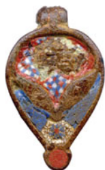
FIG. 14. Wood Burcote, seal-box with denarius inside (No. 14). Scale 1:1.

The seal-box, on opening, was found to contain a Trajanic denarius dated to A.D. 117, with the figure of Fortuna on the reverse (NARC-B9F672, RIC 315). While seal-boxes have occasionally been found in association with coin hoards, plausibly as the seal for a bag, no parallel has been found for the placing of a coin within the seal-box. 68 As an isolated instance with limited context information it is very difficult to interpret, but the coin might be suggested to have been a votive offering rather than to have been placed in it for safe keeping.