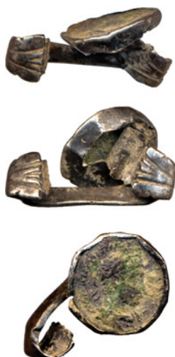
FIG. 29. Spetisbury, silver finger-ring with bezel containing denarius (No. 29). Scale 1:1.

(29) Spetisbury (DOR-B43092; 2012 T840) (FIG. 29). 129 A silver finger-ring 31.9 mm long, 19.3 mm wide and 12.4 mm high, weighing 7.2 g. The bezel is octagonal and contains a denarius of Elagabalus (A.D. 218–22) with the obverse uppermost. The coin is held in place by the folded edges of the bezel. The hoop, quite thick with a D-section, has flaring shoulders where it meets the bezel. Each shoulder is decorated with deeply incised triangular notches. The band has been bent and torn so that it is no longer attached to the bezel and at the back of the bezel a tear reveals a small part of the reverse of the coin. The coin's obverse carries the legend IMP ANTONIN[VS PIVS] AVG, with a bust facing right, laureate, and draped. What is visible of the reverse shows a laureate figure advancing left. Two similar bezels (without the bands surviving) were recorded by the PAS from Ulceby, Lincs. (Julia Maesa) (LIN-A8E677) and Chirton, Wilts. (Plautilla) (WILT-B0C652). The setting of coins within jewellery is not commonly documented in Britain and known examples are predominantly in gold. 130