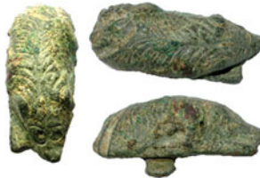
FIG. 18. Charndon, small figurine in the form of a sleeping hound (No. 18). Scale 1:1.

Molossians, used for hunting, are also common in other portable media, for example lamps, gems and figurines as well as Iron Age coins from Britain. 82