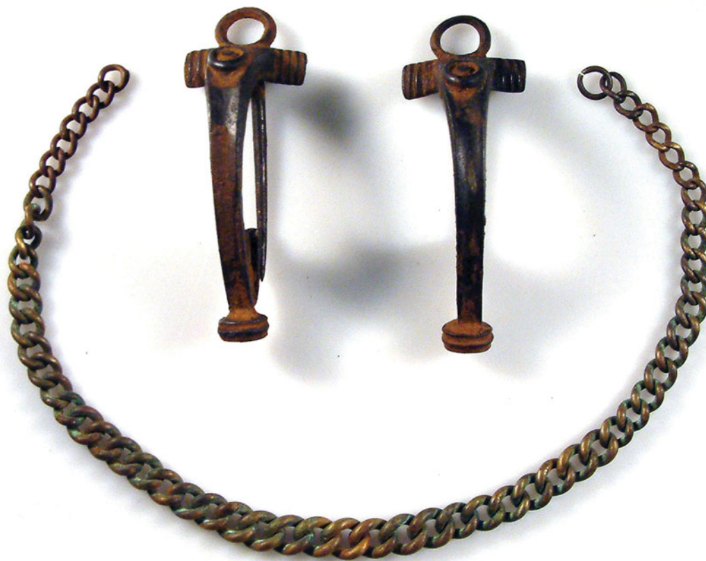
FIG. 5. Near Market Weighton, two headstud brooches and associated chain (No. 5). Scale 1:1.