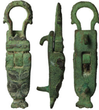
FIG. 27. Owslebury, the female part of a 'bar-and-keyhole' strap-fastener (No. 27). Scale 1:1.