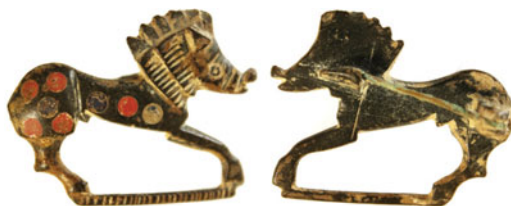
FIG. 26. Downton, brooch in the form of a running wild boar (No. 26). Scale 1:1.

are scored across the face. As well as a very high crest, the thick neck carries a double ‘mane-like’ grooved collar. The rump, with genitals indicated, is disproportionately large, a feature accentuated by a groove which separates it from the body. It carries five enamelled dots in a quincunx, red with the exception of the blue central dot. On the body are three further dots in red and blue inlay. The hooves rest on a horizontal bar, decorated with notches, which forms the groundline. On the back, the head of the pin is held between two close-set lugs.