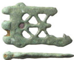
FIG. 4. Sessay, baldric fitting of third-century A.D. date (No. 4). Scale 1:1.

(4) Sessay (SWYOR-91A033) (FIG. 4). 26 An incomplete copper-alloy hinged baldric fitting of third-century A.D. date, 33.7 mm long, 22.3 mm wide and 4.9 mm thick. The openwork plate is pierced by triangular and semi-circular perforations which leave a network of spokes connecting the edges of the plate. At the unbroken end is a circular hole, perhaps for a rivet, which is filled with copper-alloy of a different patination to that of the plate, and a hinge with three loops which hold the corroded remains of the axis bar. Similar baldric fittings are known from Aldborough, N Yorks., Silchester, Hants., and Ashwell, Herts. (BH-D36487). 27 Belt fittings and buckles of the early to mid-imperial period are widely distributed across eastern and southern England. 28