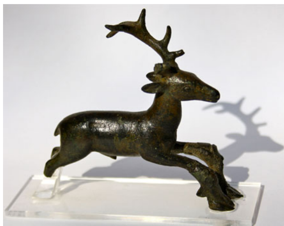
FIG. 9. Kirkby la Thorpe, figurine of a running stag (No. 9). Scale 1:2.

This find adds to a small number of stag figurines from Roman Britain, including one possible PAS example from Gainsborough, Lincs. (NLM4353); a metal-detected find from Woodingdean, Sussex, carries a similarly impressive set of antlers. 44 In one instance at least, the findspot — a temple outside the Balkerne gate at Colchester — suggests the use of stag figurines as votives. 45 The proliferation of stags as well as other game in many media, including zoomorphic brooches, ceramics and glass as well as figurines, reveals the likely significance of hunting among the population of Roman Britain. 46