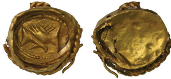
FIG. 30. Bradford Abbas, oval bezel in gold with dextrarum iunctio motif (No. 30). Scale 2:1.

dextrarum iunctio rings in the British Museum collections from Richborough and the Thetford Treasure. The motif is also reproduced in other media in the province, for example on gems and medallions. 132