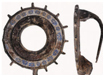
FIG. 33. Teston, enamelled disc brooch with millefiori glass inlay (No. 33). Scale 1:1.

(33) Teston (KENT-0542E1) (FIG. 33). 143 An enamelled disc brooch of probable second-century A.D. date, probably in an alloy of tin rather than copper. The brooch is circular with a rectangular section and is 29.1 mm in diameter, 1.7 mm thick and weighs 6.8 g. The disc has a large opening in the centre, and twelve rounded projections surviving around its rim with the remains of four more missing. The disc carries two concentric circles of enamel decoration. The outer has nineteen small panels of fine millefiori glass, with space for five more which are now lost. Each contains an eight-petal blue rosette with a red dot in its centre on a white background. The inner register appears to be filled with a single colour, which is now degraded. The reverse is undecorated. The head of the complete pin, 23.4 mm long, is hinged between two sub-rectangular lugs. Its catchplate projects from beneath the brooch. Hattatt records another example with an open centre. 144 The ring form is rare and it is difficult to find close parallels for the detailed design of this brooch, but it is likely to be related to the series of disc brooches with concentric rings of complex millefiori or blocks of enamel probably made on the Continent. 145 Similar decoration is also found on other objects, for example the seal-box from