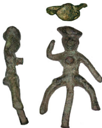
FIG. 12. Carlton in Lindrick, figurine of riding male (No. 12). Scale 1:1.

Although uncertainties over dress and attributes do not allow the figure to be unambiguously identified, the pose is similar to the riding martial god of whom numerous figurines are documented from eastern England. PAS examples include those from Stoke cum Quy, Cambs. (SF-99E3E4), Gate Burton, Lincs. (LIN-D53ED6), and Riseley, Beds. (BH-B0BF961). The findspot of this example lies close to the north-eastern extremity of the distribution of the riding figure. 61