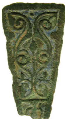
FIG. 23. Combs, enamelled panel from small hexagonal flask (No. 23). Scale 1:1.

from the border. The second, smaller panel of decoration is mostly lost, but what survives closely resembles the decoration found on a very similar vessel from Corbridge, i.e. the tips of a leaf pair which rise from a pelta. 100 On the outside edge of the enamelled fields is a notched border. This piece is very closely paralleled in most of the other vessels of similar form, one of which is a panel from a flask recorded by the PAS from Sutton, Suffolk (SF10415). 101