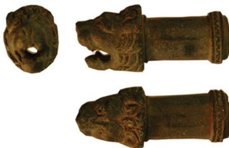
FIG. 6. Roxby cum Risby, handle with lion's head terminal (No. 6). Scale 1:1.

(6) Roxby cum Risby (NLM-10C624) (FIG. 6). 33 A copper-alloy hollow-cast handle with a terminal in the form of a male lion's head. It is 39.4 mm long, 16.9 mm wide, 17.6 mm high (lion's head) and weighs 24.5 g. The lion's head, with jaws agape, is well modelled, with muzzle, teeth and eyes crisply rendered, and the strands of the thick mane clearly delineated. The narrower fluted handle terminates in a thicker collar with crenellated ornament. Behind the teeth is a round aperture 4 mm in diameter. Key handles of a similar size with similar lion-head terminals are widely distributed, but close parallels have not been found for this piece. 34 The high quality of modelling, the naturalistic rendering of the lion's head, and the competent execution of decorative motifs make this comparable to some pieces of continental provenance. 35