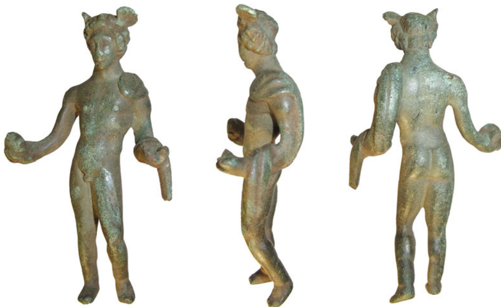
FIG. 8. Nettleton, figurine of Mercury (No. 8). Scale 1:1.

This common pose for the god is documented in many other examples from Britain and beyond. Mercury is the most frequently documented of all figurines in the province; Durham's corpus records 103 examples and other instances are also known from the PAS. 41 The findspot lies at the north-eastern extremity of the distribution of Mercury figurines; examples in northern Lincolnshire being rare. 42