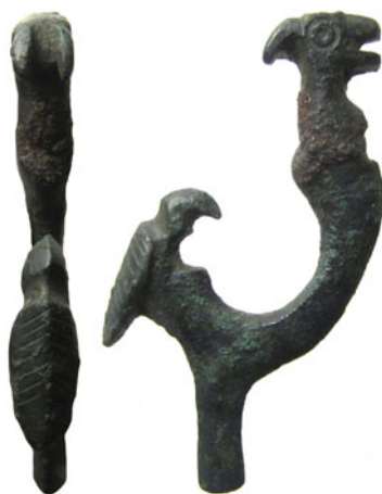
FIG. 11. Normanton, object of uncertain function with zoomorphic terminals (No. 11). Scale 1:1.

(11) Normanton (SWYOR-1D8EA3) (FIG. 11). 57 A copper-alloy object, with zoomorphic terminals, representing perhaps a goat and an eagle. The object is 58.8 mm long, 25.2 mm wide, 7.1 mm thick and weighs 19.9 g. The rod, lozenge-shaped in section, bifurcates into two arms of differing lengths. The shorter arm terminates in a figure of a bird, perhaps an eagle or other bird of prey. It is schematically rendered, with a hooked beak and hatching to represent the plumage on its wings. The longer arm terminates in the neck and head of a goat or similar animal. The horned creature is open-mouthed, with oversized eyes rendered as a punched ring and dot and two short downward curving horns on the back of its head. Both animals are facing in the same direction. No close parallel can be found; stirring rods often have zoomorphic terminals, but none of the examples documented by Kaufmann-Heinemann resemble the Normanton find and they are in any case smaller. 58