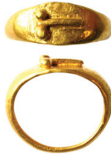
FIG. 17. Wing, gold finger-ring dating from first to second century A.D. (No. 17). Scale 2:1.