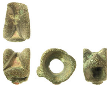
FIG. 28. Shalfleet, vessel escutcheon of Rose Hill type bowl (No. 28). Scale 1:1.

(28) Shalfleet (IOW-1D56E0) (FIG. 28). 126 A corroded and incomplete early Roman cast copper-alloy vessel escutcheon from a Rose Ash type bowl (c. A.D. 50–75), with traces of a dark greenish brown patina. It is 18.2 mm long, 16.8 mm wide and 12.1 mm thick. The object is circular in plan and has an off-centre circular 'hour-glass' aperture. The moulded outer face has two lips, two rectangular cells and a V-shaped cell which contains traces of red glass. A small break has occurred across the integral rivet which is circular in cross-section. The ring-handle of the bowl would have passed through the perforation and the rivet would have been attached to the bowl's upper wall. The inside of the aperture is smooth and the break on the rivet is abraded. There are similar examples from Langstone, Newport, still attached to the bowl, and White Castle, Llantilio Crossenny, Mons., as well as from Hod Hill, Dorset. 127 The decoration echoes the lipped links on bridle bits of Polden Hill sub-type. 128