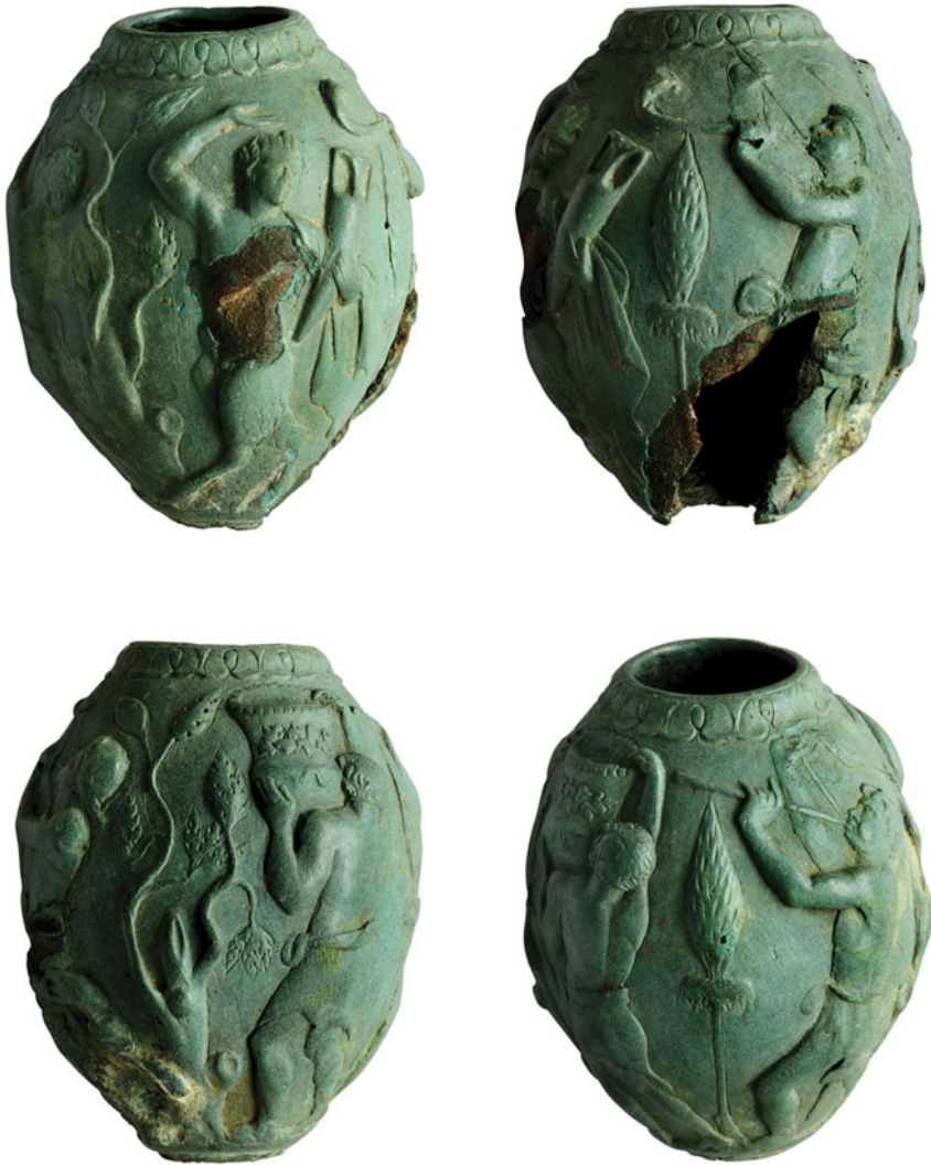
FIG. 32. Petham, balsamarium decorated with relief scene (No. 32). Scale 1.25:1.

care. The exertion of simultaneous forward motion while twisting back and playing instruments or carrying loads is well conveyed by tensed muscles and distended cheeks. The hands are less successfully rendered, with fingers and thumbs being oversized and clumsily configured. The backward glances of the satyr and the youth carrying the krater towards the figures that follow divide the group into two pairs, each comprising a bearer of wine and a musician. At the top and base of the vessel, the arms and legs of each pair converge to frame the thyrsus, especially the capping pine cone which its disproportionate size renders the most prominent feature of the frieze.