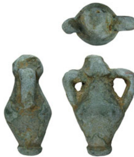
FIG. 25. Tisbury, miniature vessel in the form of an amphora (No. 25). Scale 1:1.

Miniature objects have been recorded in considerable numbers by the PAS, the overwhelming majority comprising axes though other types are documented, including weapons and miniature altars. 116 Miniature vessels in metal are rare occurrences, clay being a more common medium, and few examples have been recorded by the PAS. The majority of these represent tablewares. 117 A larger example of a miniature amphora with a form more precisely rendered and more easily attributable to a type — which perhaps served as a container in its own right — is documented as a stray find from Springhead. 118