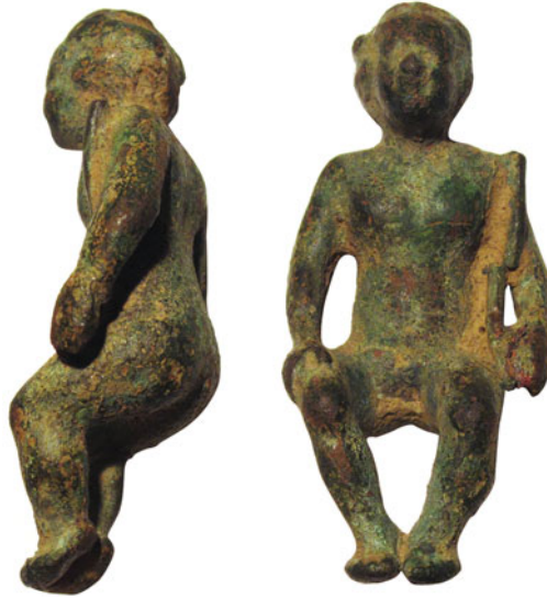
FIG. 1. Middleton St George, figurine of seated naked figure, possibly Mercury (No. 1). Scale 1:1.

(2) Piercebridge (FAPJW-D8ABE4) (FIG. 2). 16 A small copper-alloy figurine of a naked Cupid, 55 mm tall and c. 24 mm wide from arm to arm, with a maximum thickness of 13 mm including wings, generally well preserved but missing its lower right leg and part of the left foot. The facial features are well-rendered, with eyes, nose, mouth and fingers clearly delineated. The shoulder-length hair falls in curls which frame the face's chubby cheeks. A distinctive topknot of hair rises from his forehead. His right arm is extended above his head and the hand holds a short jar with everted rim. The left arm is held closer to the body and bent at the elbow; the left hand holds a discoidal object, perhaps a dish or patera. Stubby wings of unequal size project from the base of the neck. Three diagonal lines are visible on the right wing, indicating feathers. Cupid's torso is sleek though the muscles of the leg and buttocks are more strongly defined. The straight left leg bears the weight of the figure, while the right is bent, with a corresponding tilt of the hips. With its outstretched right arm the figure suggests movement, if not quite the running or flight represented in some poses of the demigod. 17