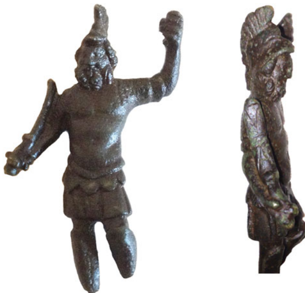
FIG. 7. Wrawby, figurine of Mars (No. 7).

After Mercury and Hercules, Mars is the third most popular male deity in figurines from Britain; 47 examples are documented in Durham's corpus. 38 The findspot of this figurine is at the north-eastern extremity of its distribution, which focuses on southern and eastern England. 39