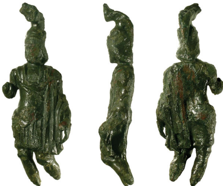
FIG. 19. Stanstead Abbots, figurine of Mars (No. 19). Scale 1:1.

This representation of Mars as a bearded mature figure in muscled cuirass is a common type in the province. In comparison with the figure from Wrawby described above (No. 7), its iconography is more typical of the type, though some of the minor details lack close parallels, for example the wearing of a cloak and baldric, and the neck of the cuirass is more commonly rounded than square as here. 84 This is a more classicising piece than many, though its poor preservation makes close comparison with similar pieces difficult, for example the figurine from Earith, Cambs. 85 The style may indicate an early imperial date. 86 The findspot lies squarely within the main focus of the distribution of Mars figurines. 87