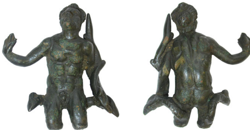
FIG. 10. Caenby Corner, figurine of a giant (No. 10). Scale 1:1.

The slight forward inclination of the torso accentuates the strongly defined musculature, its pectorals and abdominals on the front as well as the muscles of the back and buttocks. A tuft of hair seems to sprout from the base of the pectoral cleft. Below the genitals, fringed by pubic hair above, are short upper legs, also well muscled. From the back of each comes a serpent body which curls around the back of the figure and out from its side to left and right. Chevrons on both bodies render their scales in a stylised manner and each snake terminates in a crested head on which the surface decoration is rubbed smooth. The figurine may originally have been mounted, but there is no trace of attachment.