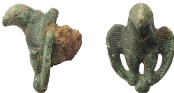
FIG. 13. Worfield, mount in form of an eagle (No. 13). Scale 1:1.

weighing 50 g. Its wings are part extended and reach to the bird's feet. The bird faces forwards and its head, with small circular eyes, tapers to a blunt, slightly hooked beak. The body is simply modelled, squat but with powerful legs and chest. The plumage on the body, upper legs and face is depicted with deep hatching. The eagle stands on a small spherical ball between its feet. Protruding from the back are two rectangular copper-alloy lugs which are covered with iron corrosion. Mounts and figurines in the form of an eagle are not infrequent — a likely product of their association with Jupiter. The modelling of this mount is more sophisticated than the other schematically rendered examples so far recorded by the PAS. A similar example is known from Grimmlinghausen (Neuss). 63