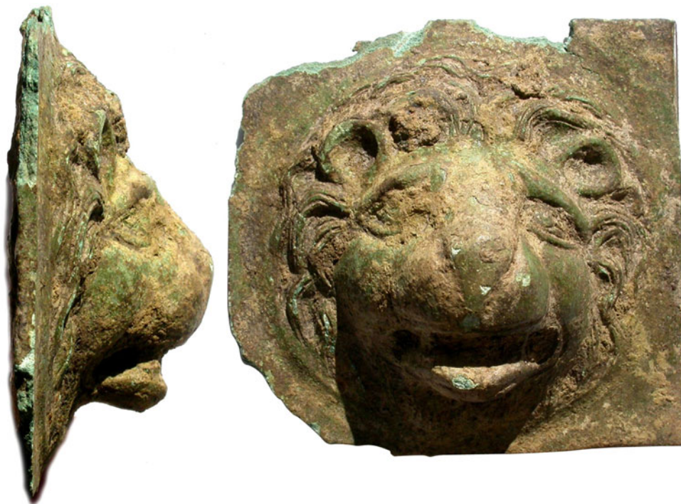
FIG. 16. Wing, one of two furniture or box mounts in the form of lion heads (No. 16). Scale 1:1.

the bezel is a schematic phallus, in low relief, comprising a plain circular-sectioned wire with a pair of flanking basal spheres for the testicles. A very similar example with a phallus soldered on the bezel is known from Faversham, Kent. 78 The phallus as a powerful apotropaic device to avert the Evil Eye and ensure good fortune, is widely documented by the PAS as a pendant and in other forms in rural contexts. 79