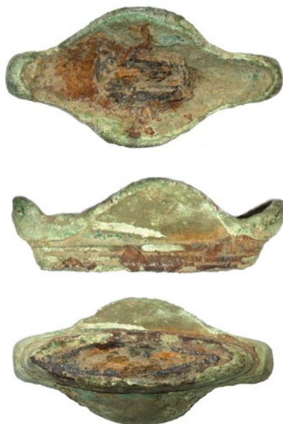
FIG. 31. Cranleigh, guard or hilt component from sword or dagger (No. 31). Scale 1:1.