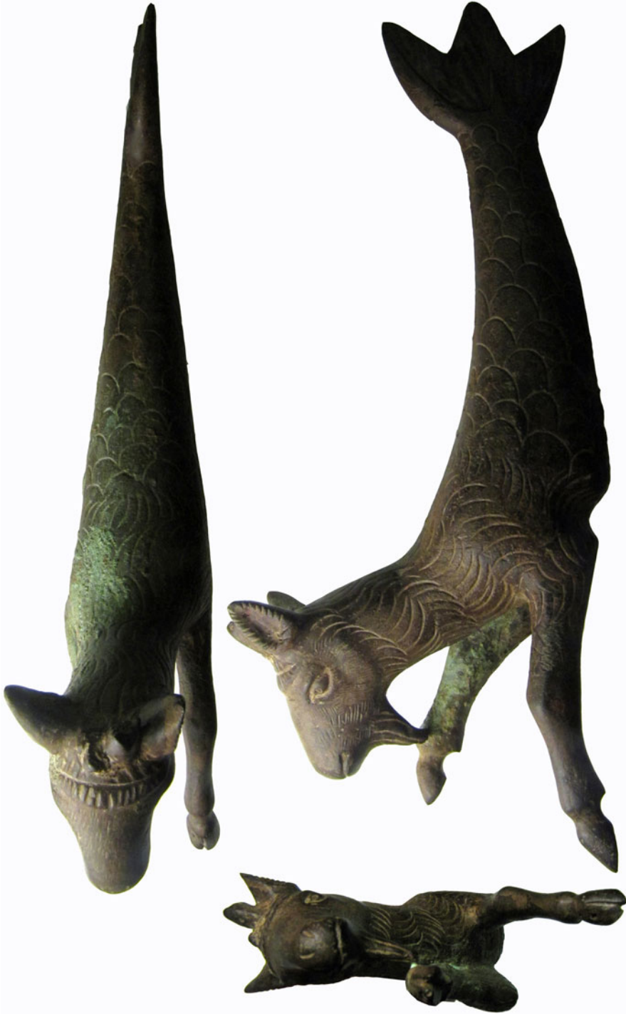
FIG. 24. Burrington, figurine of capricorn (No. 24). Scale 2:3.