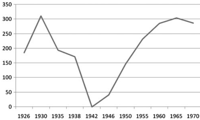
Figure 5. Imports ('000 tonnes) of bacon and ham from Denmark. H. F. Marks and D. K. Britton, A Hundred Years of British Food and Farming: A Statistical Survey (London, 1989), 221.

with long, lean carcasses. Enthusiasts saw these measurements not simply as an assessment of breeding quality, but also of feeding and management. In this way, they enhanced their surveillance over pigs' bodies and, by extension, over the employees who cared for them. 39