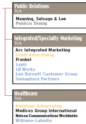
Diagram 1: Organogram of Publicis Groupe group.