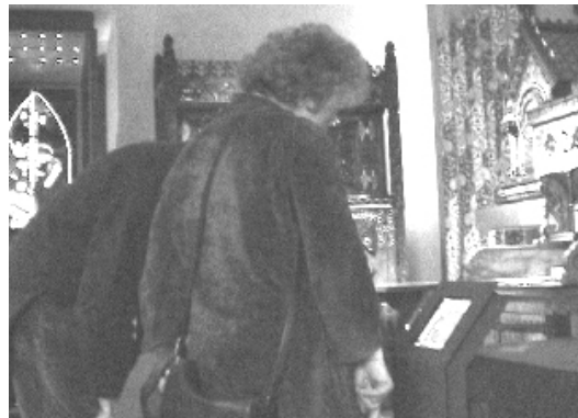
Figure 1: Visitor viewing the film at the touch-screen

right of the Burgess washstand. The film is begun by touching the screen and continues without interruption until the end.