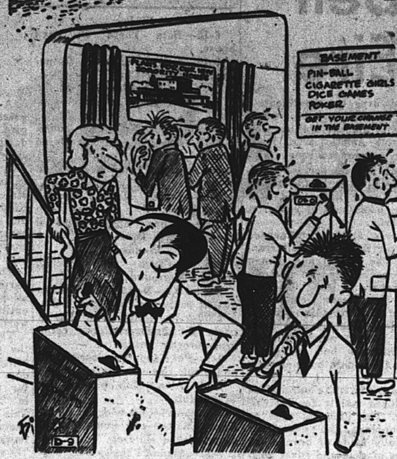
"You're lucky. I got down in 15 minutes—most of our dates are required to wait an hour."